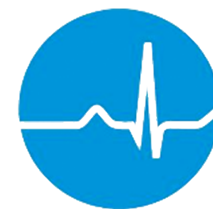
The Global Awards